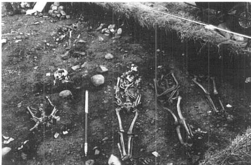
Top: view of large excavated ditch and gravel bank which contained cillín burials. Left: burials within the enclosure.

The majority of burials exposed had no associated finds. Fragments of slag were obtained from the grave fill of a very small number of graves, and a single decorated bone bead and tiny fragments of decorated bone comb were recovered from two separate graves.